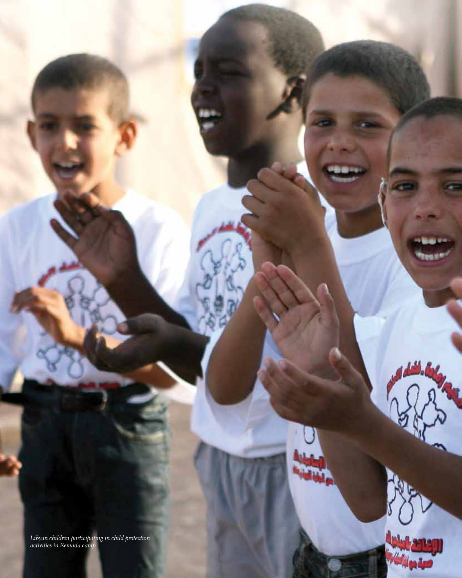
Libyan children participating in child protection activities in Remada camp