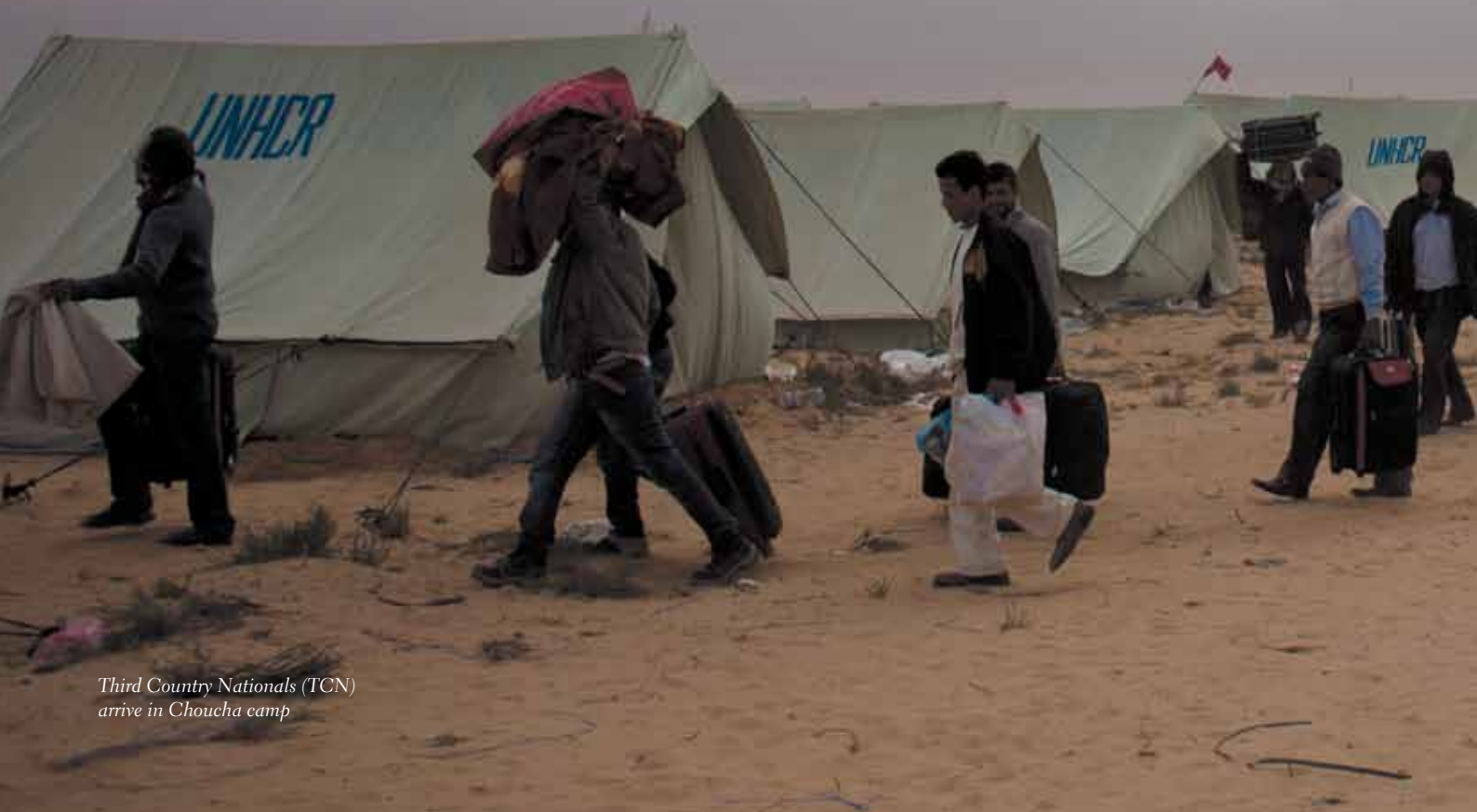
Third Country Nationals (TCN) arrive in Choucha camp