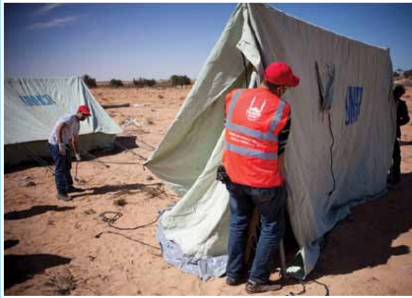
Medanine, Tunisia: Medical Pharmacy supported by Islamic Relief